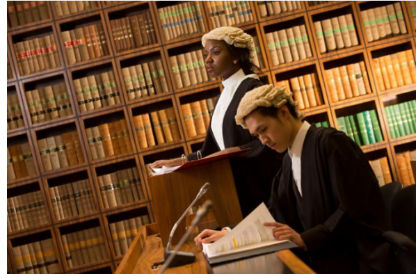
Image 1: Two Law students in the university's mock Queen Crown Court (Bullock, 2021)