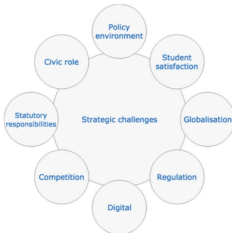
Figure 1: Key higher education strategic issues

Despite this, there was confidence in the ability of institutions to rise to these challenges. In particular, the survey revealed that: