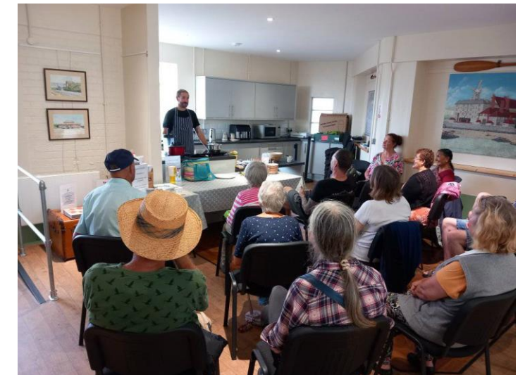
Friends of Bishopstone Station community workshop