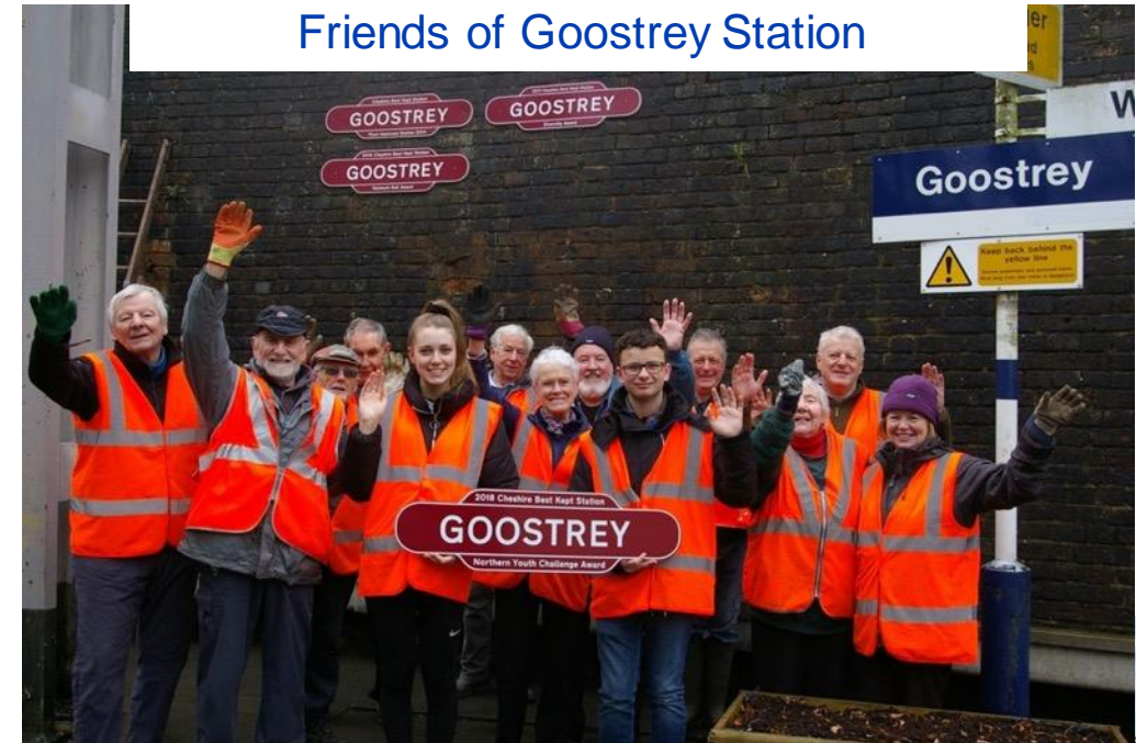
Friends of Goostrey Station