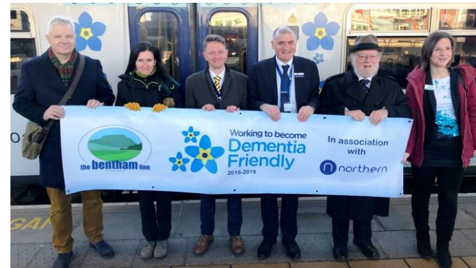
Bentham Line CRP working with Northern & local charities to become a dementia friendly line