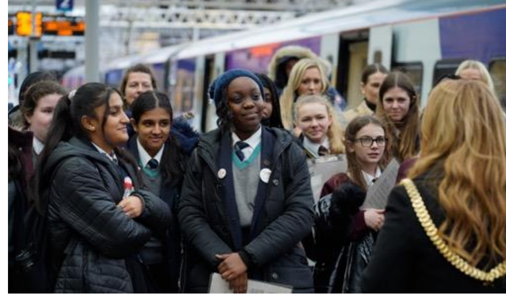
Community Rail Lancashire rail confidence programme