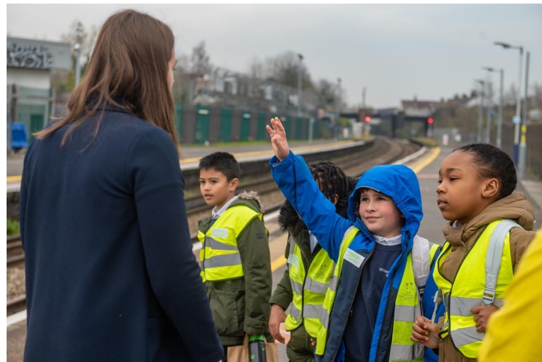
Platform Rail community rail education scheme (Sevenside, Gloucestershire, Worcestershire, and Transwilt Community Rail Partnerships)