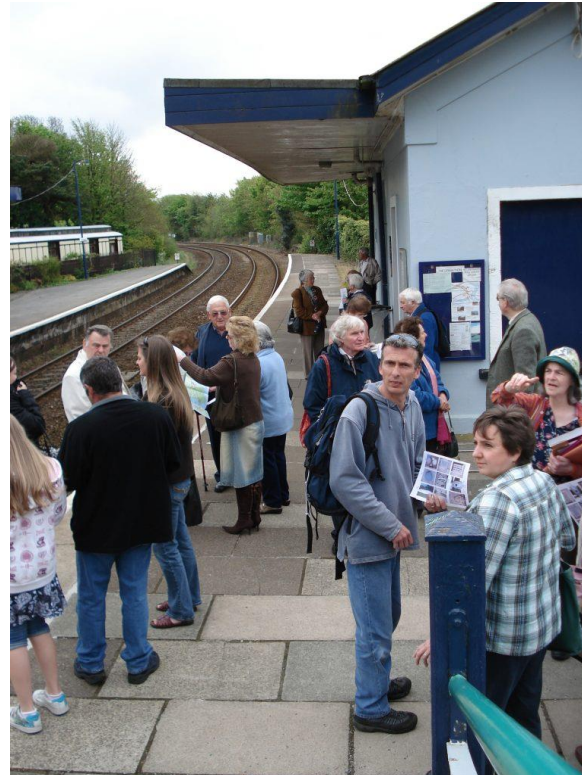
St Germans & Area Public Transport Group consultation on travel needs