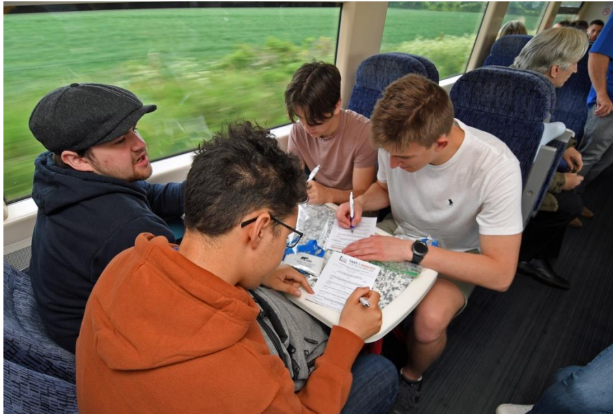
Kent CRP event with Ashford College students in Community Rail Week