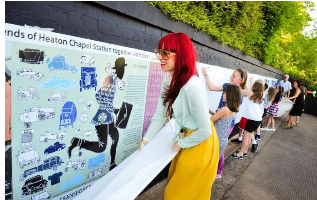
Friends of Heaton Chapel Station arts project