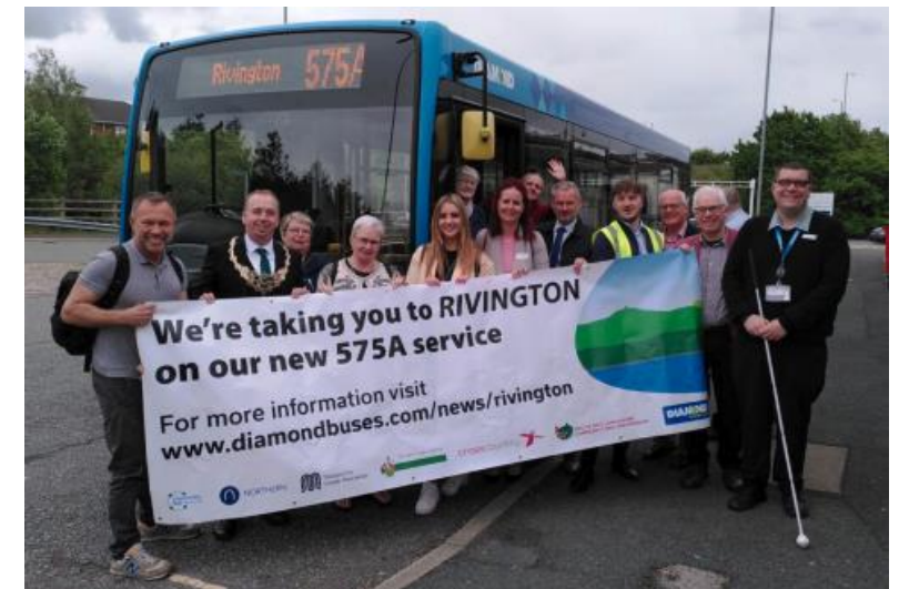
South East Lancashire CRP's Rivington Rambler