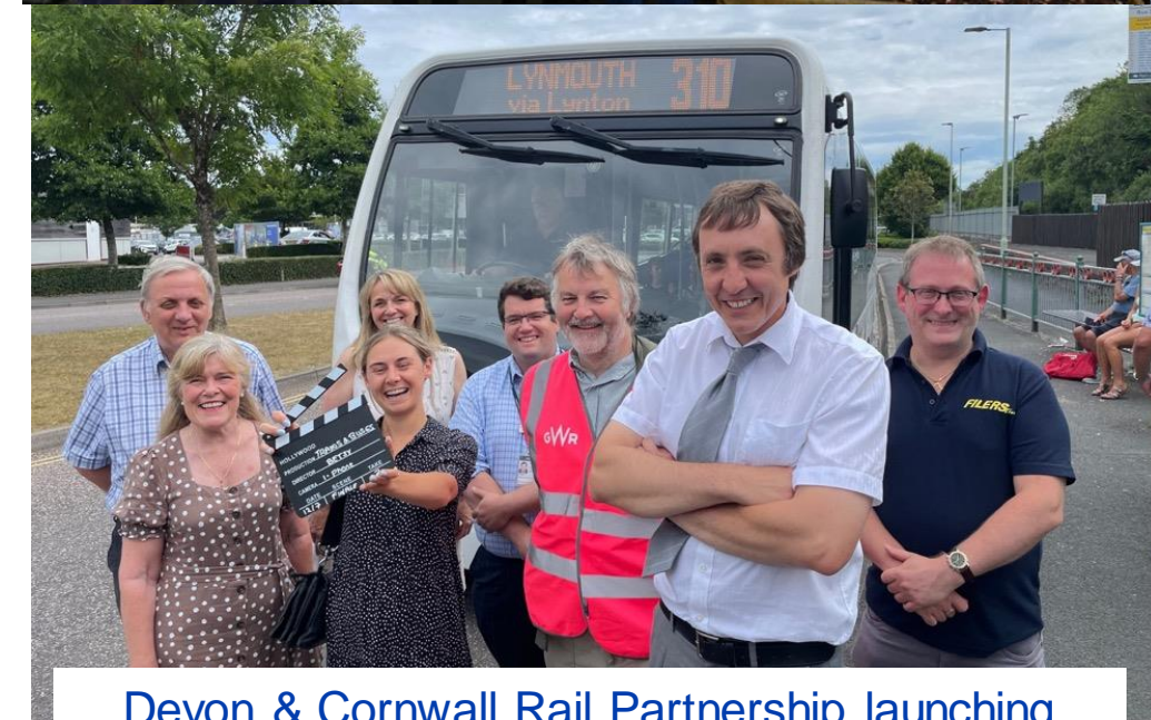
Devon & Cornwall Rail Partnership launching multi-modal promotional videos