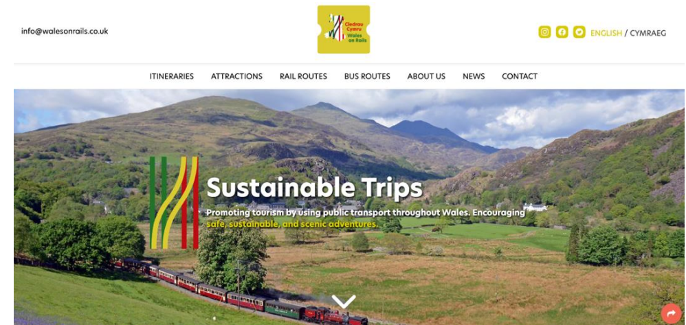
Wales on Rails campaign by Wales & Borders CRPs and Great Little Trains of Wales