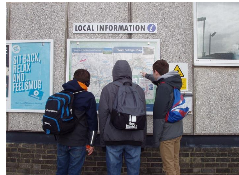
Friends of Wool Station wayfinding and travel information